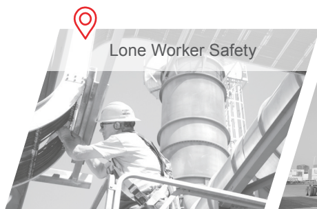
Lone Worker Safety

The GL320MG is the LTE version of our best-selling GL300, which is the most popular series in our range of asset trackers with large deployments worldwide. It is used for a wide range of applications which require real-time location knowledge, such as private investigations, package delivery, temporary tracking of vehicles, long distance transportation, endurance racing and animal management. As one of the market leaders in reliable battery powered asset trackers, our products are targets for imitation, but we are happy to say that up to this day, our GL300 still leads the field in battery life and overall performance.