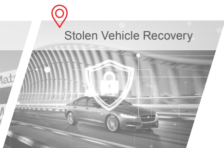
Stolen Vehicle Recovery